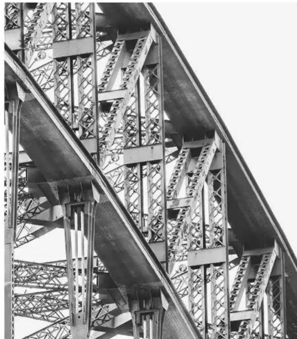
The Engineering Print

Massive scale at a fraction of the cost.